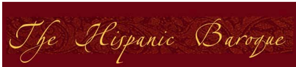
The Hispanic Baroque Project of The University of Western Ontario