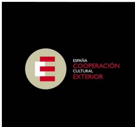
Embassy of Spain in Canada